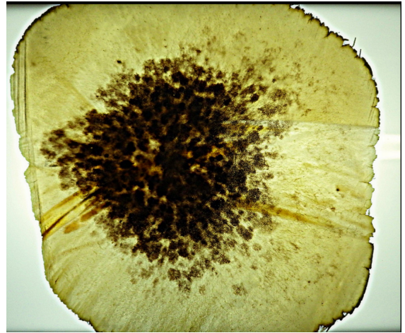
Figure 1. Polished back-lit cross slice through an anterior horn of a white rhino showing the more heavily melanin-pigmented cornified epidermal tissue in the core of the horn.

Samples from five sets of white rhino horns retrieved after horn infusion with indelible dye combined with ectoparasiticides (SANParks: 1 anterior and 1 posterior